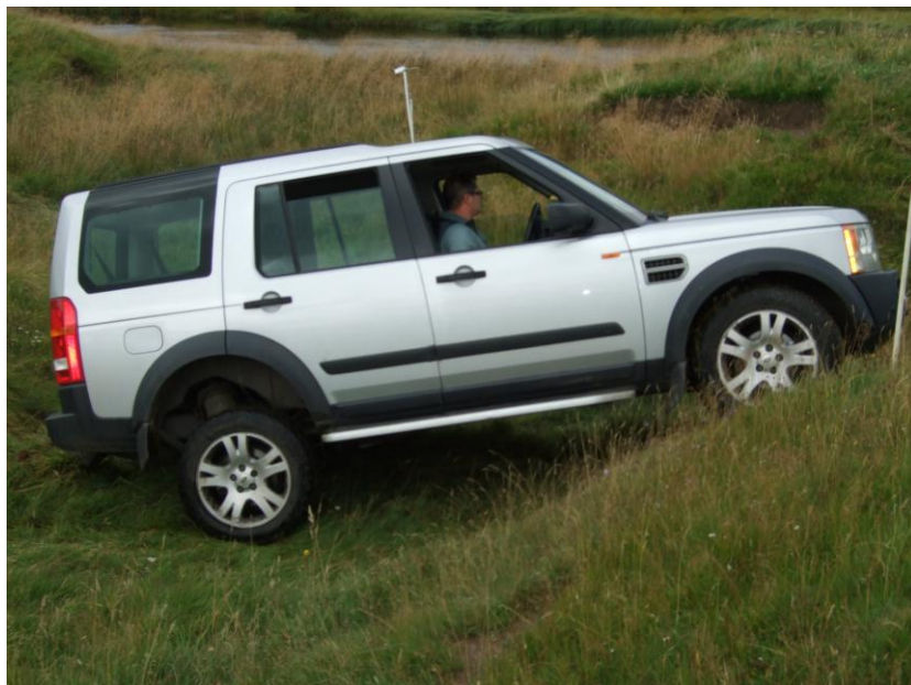
Discovery 3 proving its worth at the Laggan Trial