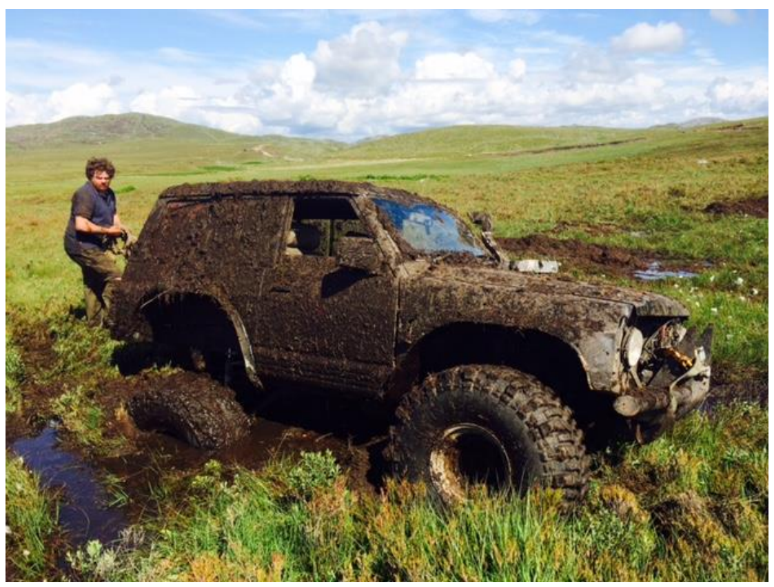
These guys don't get stuck often but when they do...