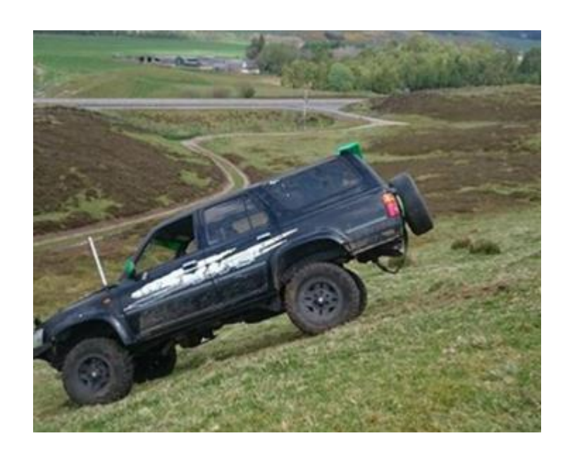
Something you don't see trialing often!