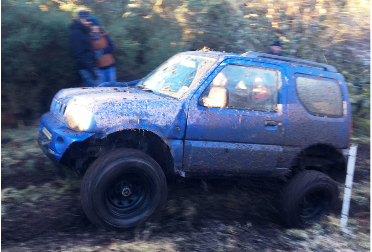
A brace of Jimnys (or, Jimnies, perhaps?)