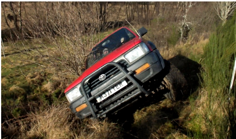
And another one from Belivat, last year. Sorry, not sure who.