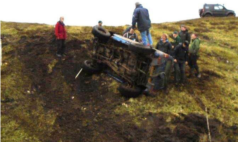
Photo at Nuide trial