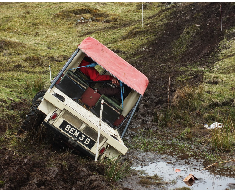
Team SPENCER in the bog (but not bogged) at Nuide.

Highland Hospice, Ness House, 1 Bishops Road, Inverness IV3 5SB. Highland Hospice is a registered Scottish Charity No: SC011227