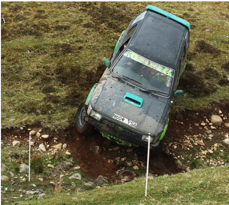
MICHAEL'S Toyota, 3 litre diesel + various mods, at Nuide. (before the CV let go...)

Meet at Skiach Services at 10am on the day.