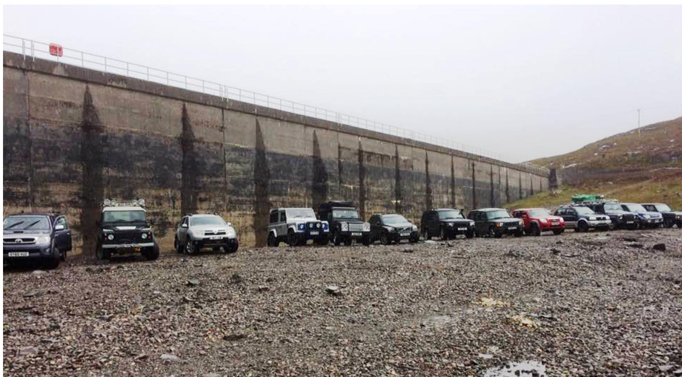
Dam Fine Mystery Tour - the buffer dam at Monar