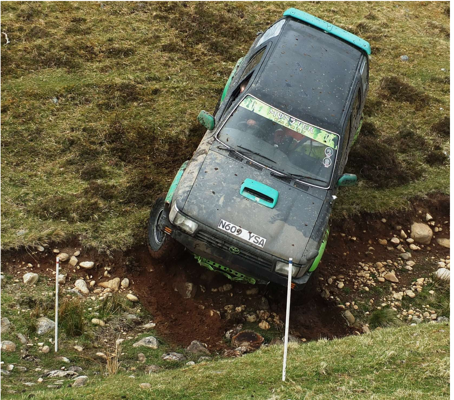
Top view of MICHAEL CRUICKSHANK'S Toyota Surf at Nuide, 2017.