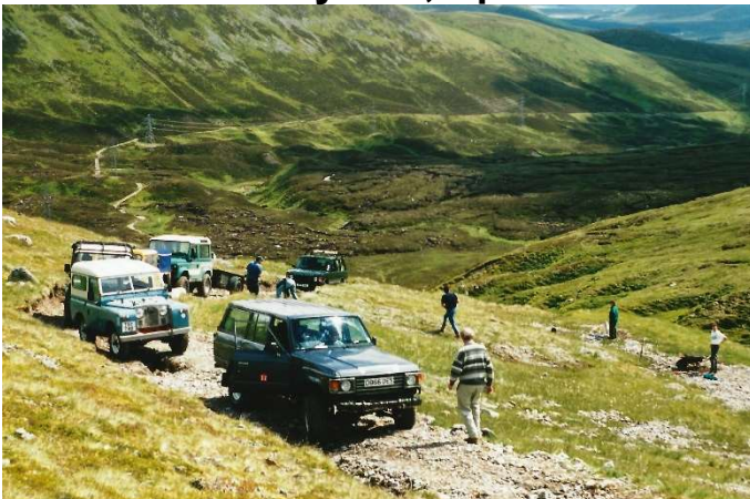
East side of the Corrieyairack Pass, during a H4WDC work party, 2002.

There will be a club run up the WEST side of the pass, on Sunday 17 th June . More details inside newsletter.