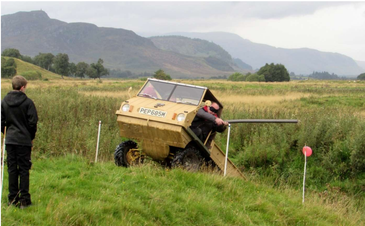
JOHN MACLENNAN and co driver - still trying to burst a balloon.