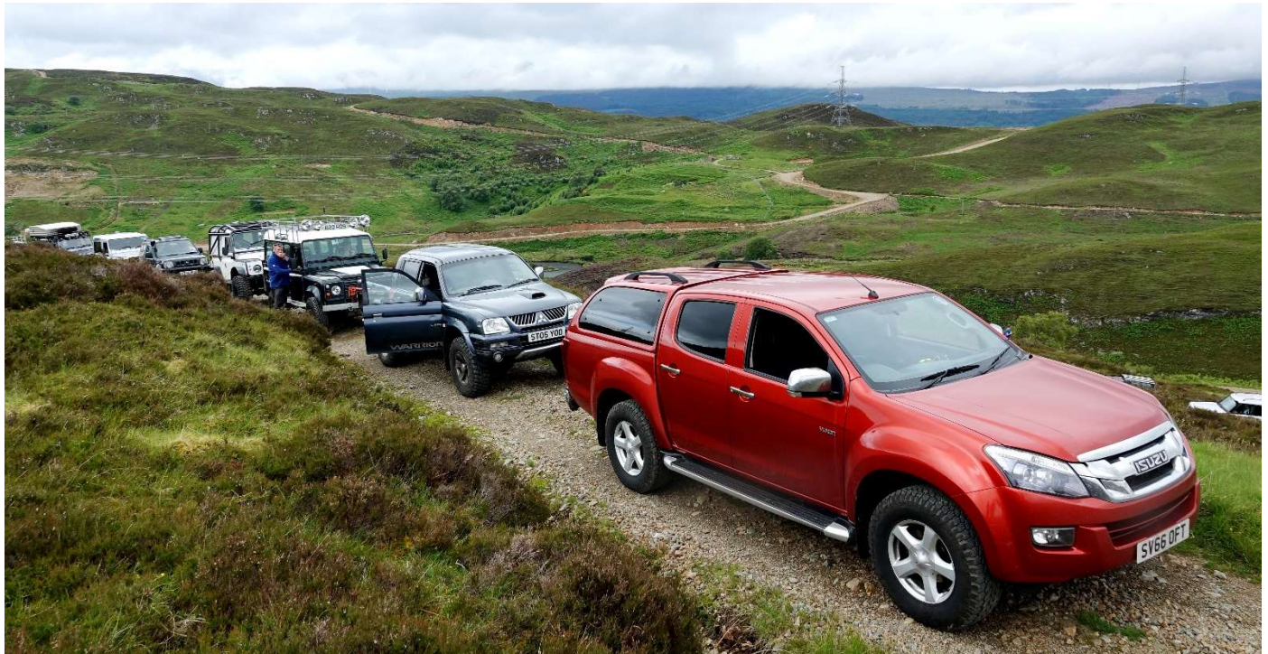
Convoy on the Corrieyairack, June 2018. What a great day that was.