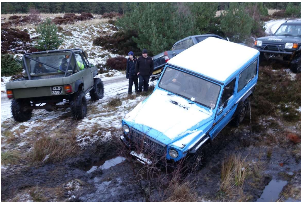
Start of the first section, Inverarnie.