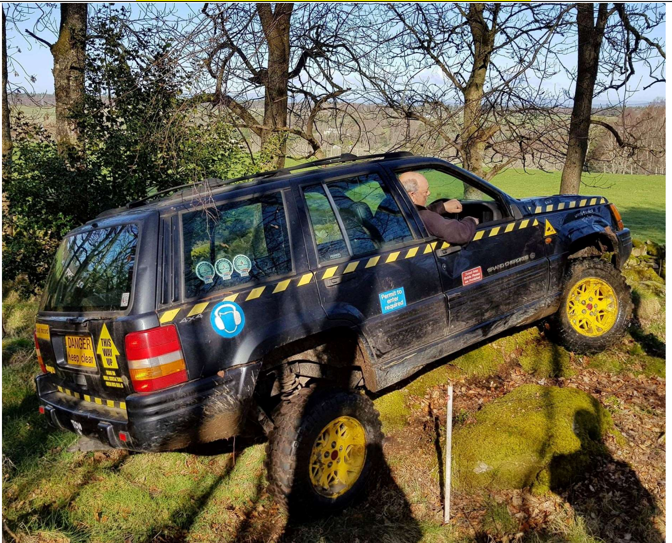
IAIN JAMIESON in the Jeep at Galcantray.