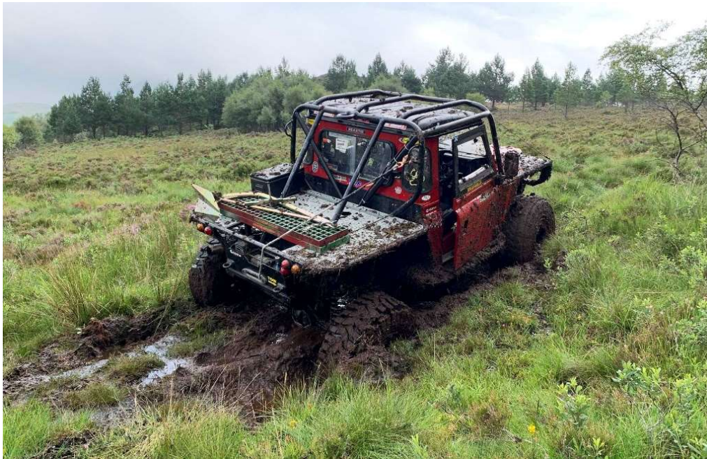
Photo: Colin Morrison showing the boys how it's done!